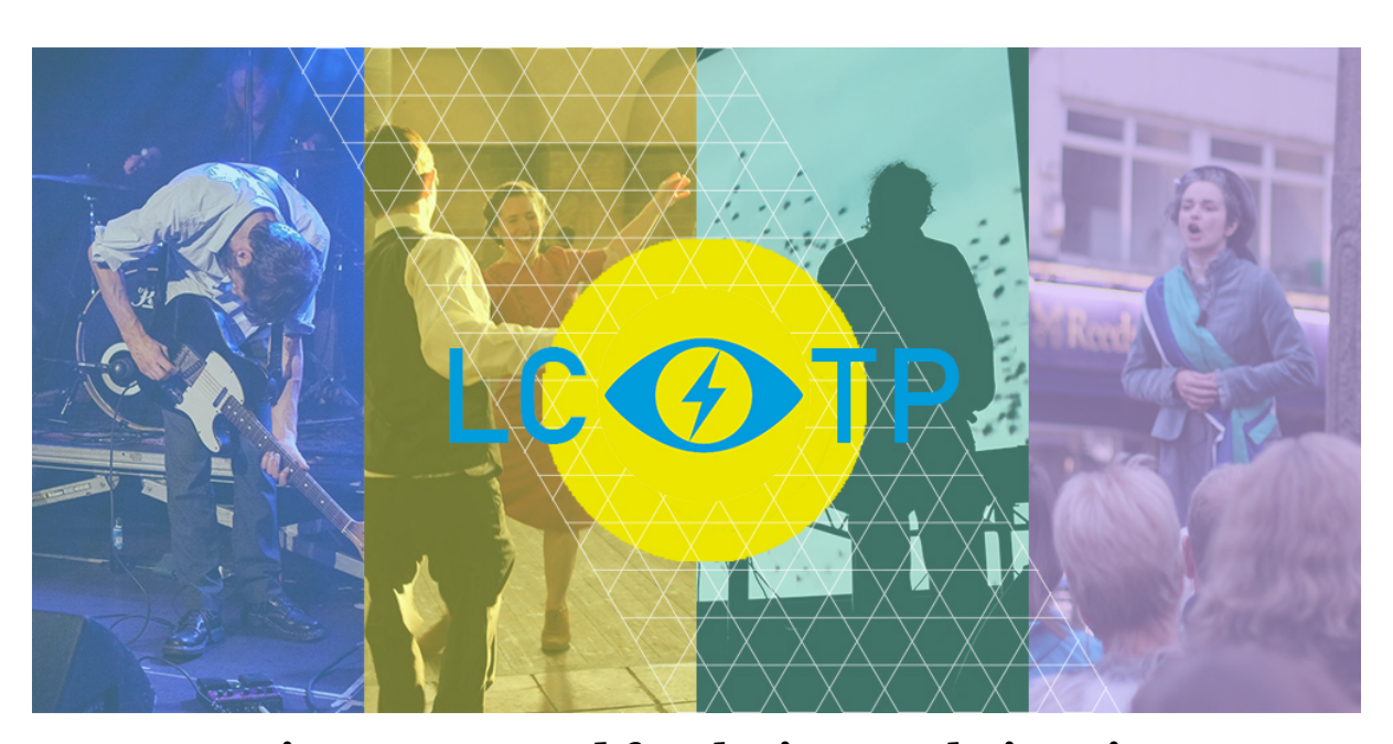
30 artists announced for the inaugral Live Cinema Talent Pool

Pre-order your copy of Live Cinema: Cultures, Economies, Aesthetics <u>here</u>